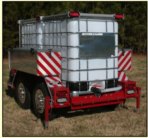
NFPA Lights & Stripes - Optional