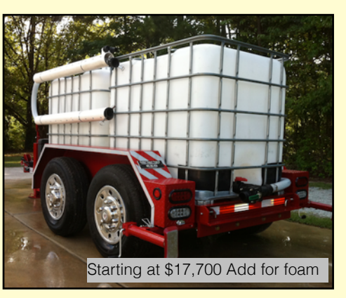
BudgetBuggy W/ 500-750 Monitor