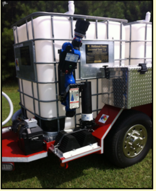
Dismounted Foam Monitor