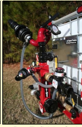
Front or Rear Firefighting Station