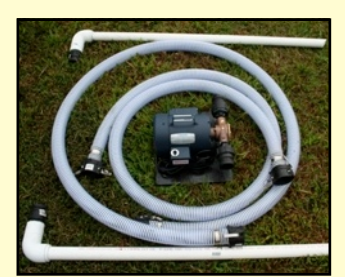
Radio Transfer Pump Kit