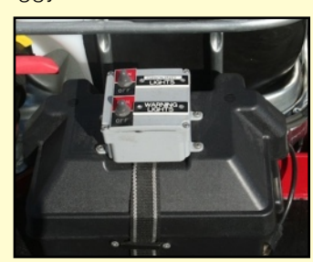
7 Hr Battery Power

FoamChariot® II is a stable, self contained, rapid deployment asset, designed for firefighting and spill security where truckload or railcar quantities of ethanol and ethanol / gasoline blends are involved in fire or catastrophic spills. FoamChariot® II is designed for fire departments having ample storage space, towing capacity and tight budgets. FoamChariot® II can be towed with a 3/4 ton truck and stores in a 6.5 ft. x 15 ft. space. FoamChariot® II is NFPA 1901 compliant can be stored outdoors where equipped with freeze protected AR-AFFF. FoamChariot® II's consolidated frame and tote retaining scheme is key to this unit's (patent pending) compact, 6'.5" ft. x 15 ft. storage footprint, which include: three point leveling, dual 5000 lb. torsion axels and electric brakes. FoamChariot® II is surprisingly stable and rated at highway speed, carrying 550 or 660 gal. of alcohol resistant foam concentrate. Also available is a single FoamChariot l®.