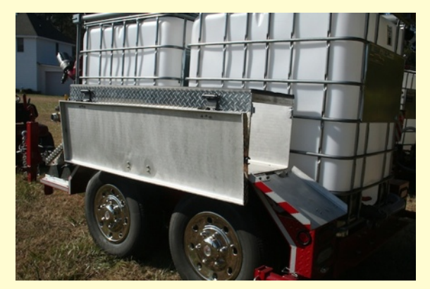
Three Door Hose/Storage Box - 0.25"